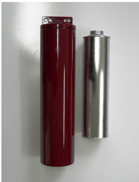
1. Illustration: FC3.0 & Replaceable Cartridge